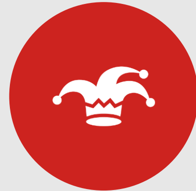
FIGURE OUT WHAT INTERESTS YOU